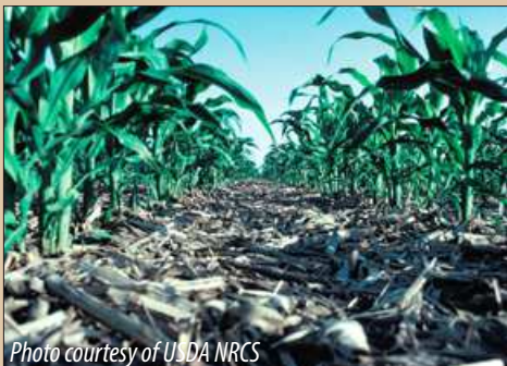
Done correctly, no-till corn cropping systems require less of a producer's time at spring planting.

Keep in mind that an improved quality of life is another reward. In addition to producing comparable yields to conventional corn when done correctly, no-till corn cropping systems also require less of a producer's time at spring planting. Often, saved time is more important than improved yields in motivating farmers to make the switch. We have heard farmers say that before no-till they never had time to go to their kid's baseball games, because their tillage systems required more equipment passes in the field than no-till. This quality-of-life issue is important to many farmers.